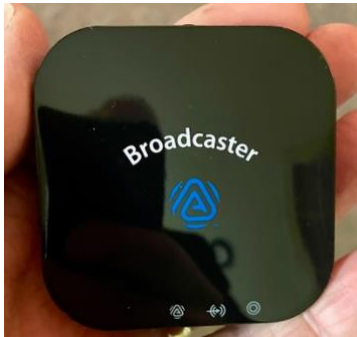
HomeSpot BA210 Auracast Broadcaster

For the transmitter I purchased a HomeSpot BA210 Broadcaster ($50 from Amazon) which I easily connected to my TV's digital optical output, using the cable provided with the device. Cables are also provided for two other connection options: RCA audio jacks and a 3.5mm microphone jack. The physical connection was quite easy, but the documentation provided with the product was disappointing because the product had been revised through firmware upgrades since the user manual was printed. But thanks to some troubleshooting assistance from ChatGPT, I was able to get it working properly.