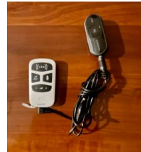
Avantree AuraGo with Med-El AudioLink Streamer

So after years of experimentation with various ways to hear TV audio (TV Ears, ClearSounds powered neck loop, ZVox sound bar, among others), I'm very pleased with the performance of these new Auracast devices. Because the technology is so inexpensive, I predict that in five years Auracast will be built into most new hearing aids and CIs and will have replaced most telecoil hearing loops and FM or Infrared assisted listening devices in public venues. It will be a welcome improvement that we can all enjoy.