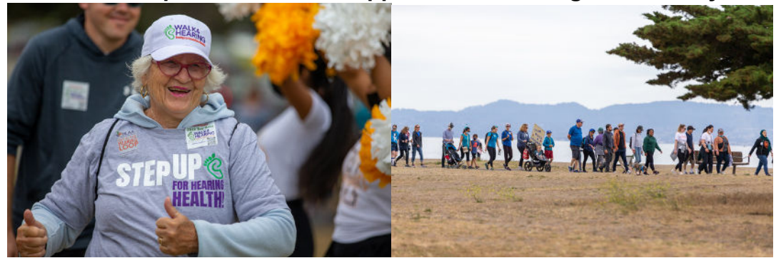
Saturday, June 3, 2023 Robert W. Crown Memorial State Beach, 8th Street, Otis Drive, Alameda, CA

Peninsula Chapter is Proud to Support Walk4Hearing on Saturday, June 3