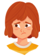
MISSING OUT ON CONVERSATIONS