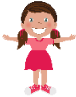
PRETENDING YOU HEARD THEM