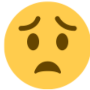
WORRYING YOU MISSED SOMETHING