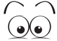
CONSTANTLY BEING VISUALLY AWARE