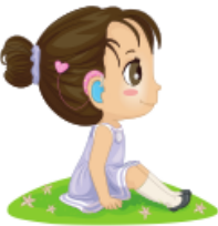
BEING STARED AT/QUESTIONED