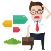
CONSEQUENCES OF MISSING INFORMATION