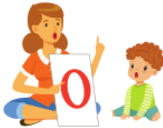
SPEECH THERAPY APPOINTMENTS