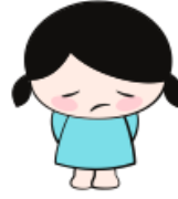
ISOLATION FROM SAYING NO TO SOCIAL EVENTS