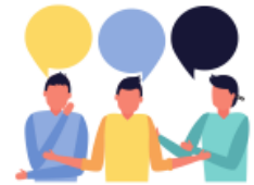
CONSTANTLY SELF- ADVOCATING