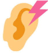
SORE EARS FROM AIDS + GLASSES + MASKS